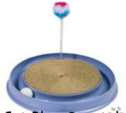
Cat Play Scratch Pad and Scratching Posts