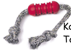
Kong Dog Toys